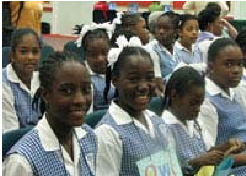
Children at the NDYS conference in Trinidad and Tobago 2008