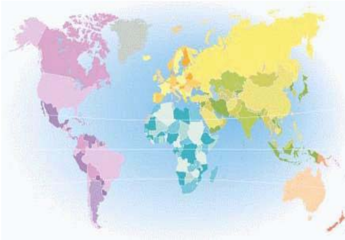
iEARN Global Map

NDYS was started with 54 schools in 15 countries, and more than 1,000 children on September 1, 2004. As one of the iEARN projects, the schools and children from 5 continents have participated at the present.