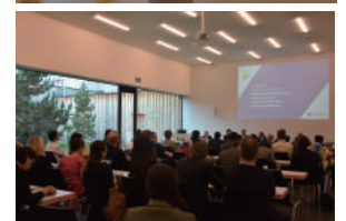
■ IDRC 2016 in Davos

Sendai City will conduct study tours and excursions in partnership with four disaster-affected prefectures (Aomori, Iwate, Miyagi and Fukushima). The number of participants for the study tours and excursions is limited. Registration will start in August 2017.