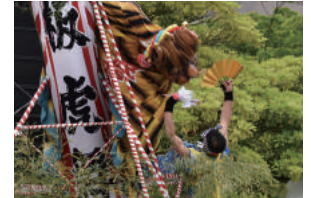
■ Tiger dance from Kesenuma, Miyagi

Public cultural events will be held at Tohoku University Kawauchi Hagi Hall in the afternoon of November 25, in cooperation with Science Agora. Bosai activities by the young generation from disaster-affected prefectures will be introduced. Performances of folk arts and music which played important roles in disaster areas will be held. Pre-registration is required and will start from September. (For inquiries, please contact IRIDeS PR office, Tohoku University, +81-22-752-2049)