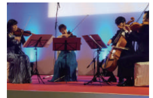
■ Ensemble performances by Sendai Philharmonic Orchestra members